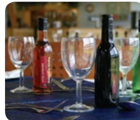
Fleming Park Golf Clubhouse now non-smoking for your comfort

To enquire further, please call 023 8068 4806 .